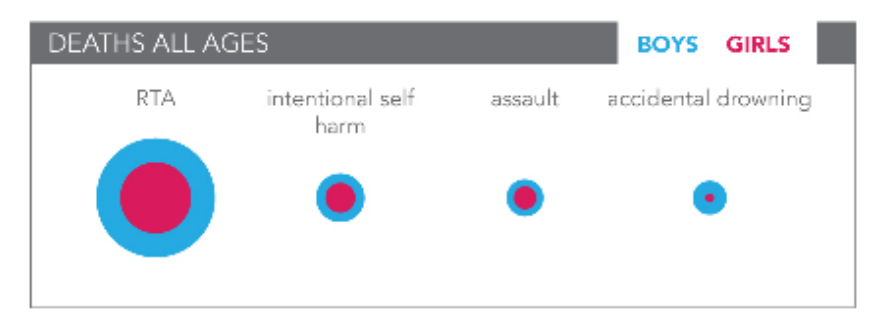
The largest non-natural causes of death among children and young people aged 1-19

<sup>15</sup> http://www.mind.org.uk/help/research and policy/statistics 2 suicide#whichage